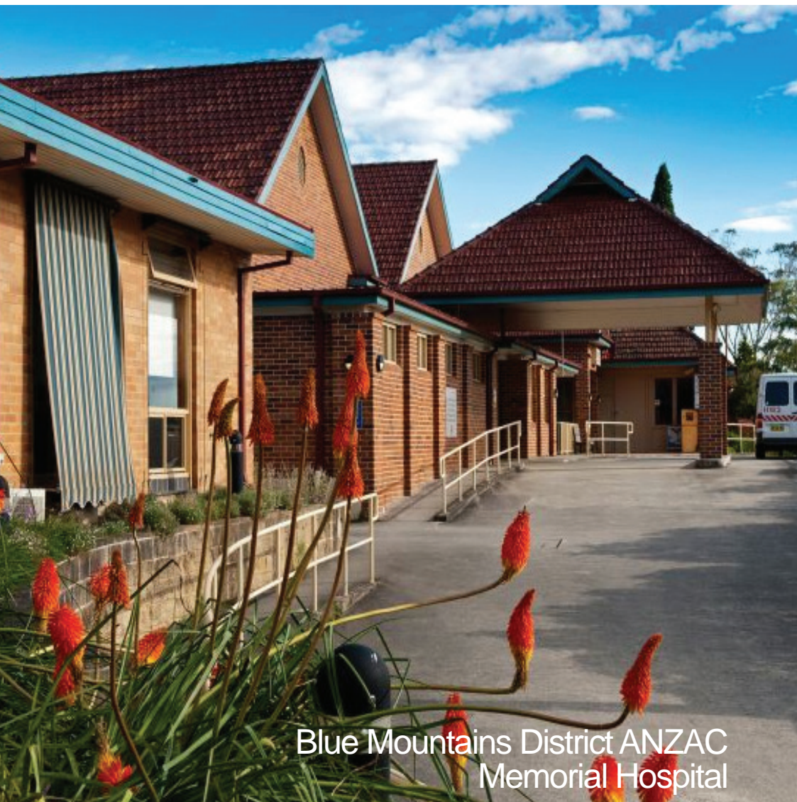
Blue Mountains District ANZAC Memorial Hospital