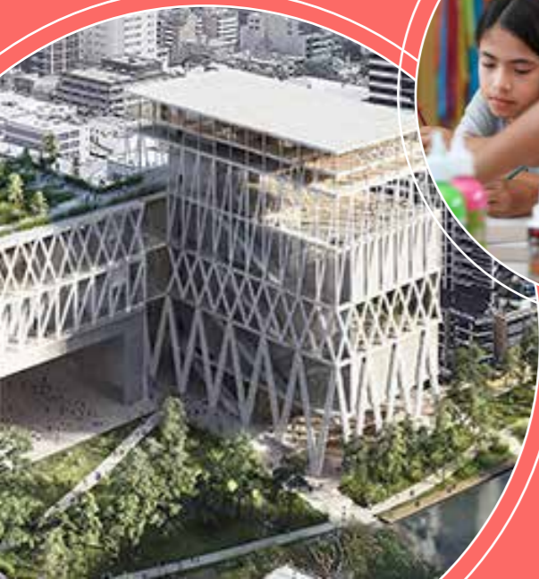
Artist's render of Powerhouse Parramatta. Image: XXXXXXXX CuriousWorks Art Workshop, GEN2168 Festival 2022. Image: Furqan Farttoosi

The film brings together nine languages, speaking to the many truths and complexities of Western Sydney communities. The success of the film and its reception by audiences proves that Australians have a strong appetite for stories that reflect contemporary life in Australia and its rich cultural diversity.