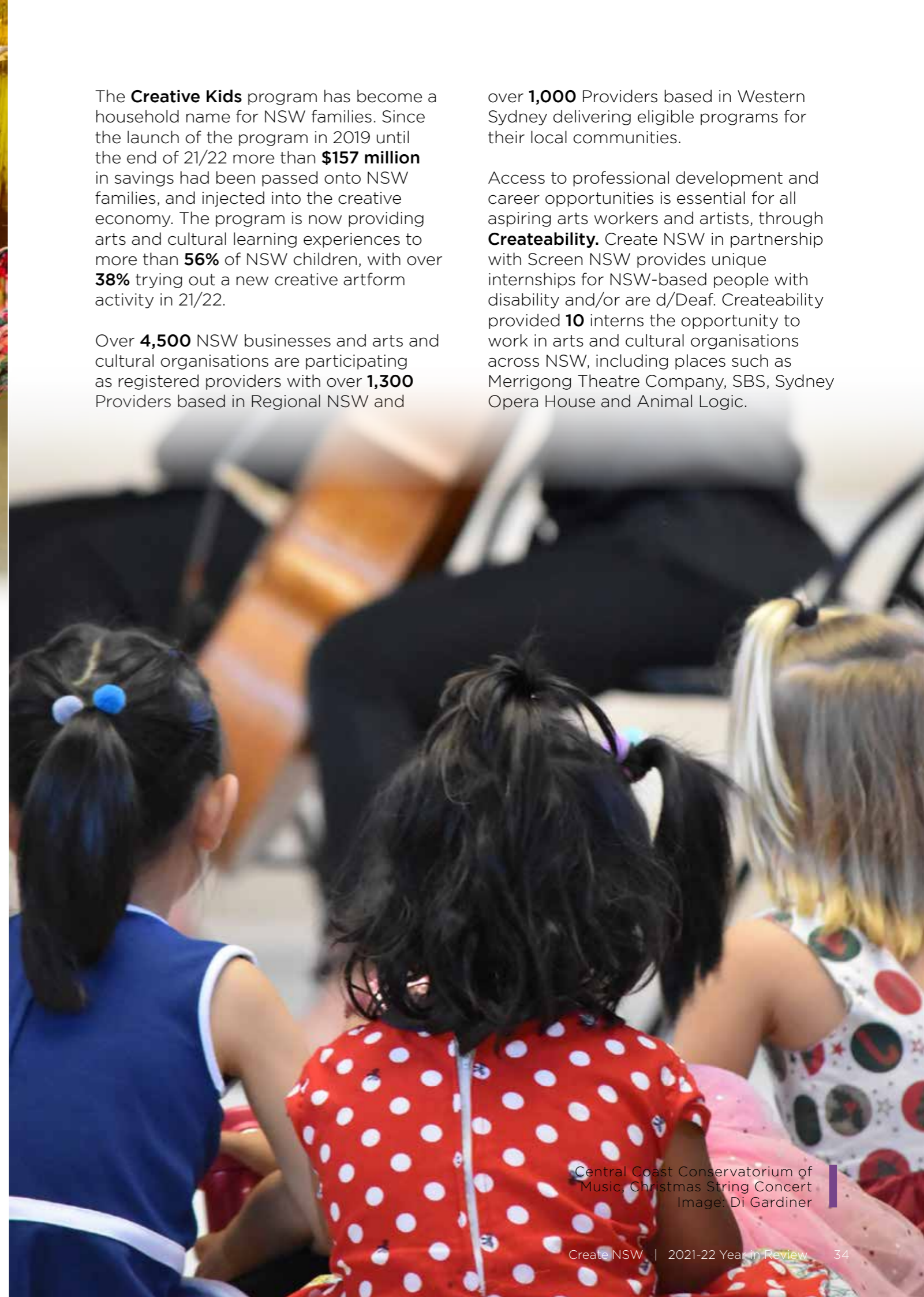
Central Coast Conservatorium of Music, Christmas String Concert

Access to professional development and career opportunities is essential for all aspiring arts workers and artists, through Createability . Create NSW in partnership with Screen NSW provides unique internships for NSW-based people with disability and/or are d/Deaf. Createability provided 10 interns the opportunity to work in arts and cultural organisations across NSW, including places such as Merrigong Theatre Company, SBS, Sydney Opera House and Animal Logic.