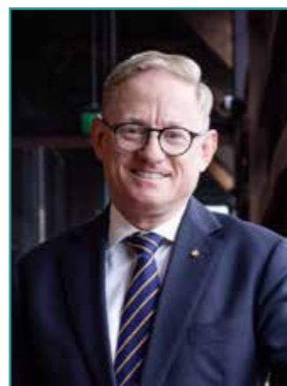
Julie Roche, Sit Beneath , installation at the Arboretum, Batlow

Minister for Aboriginal Affairs, Minister for the Arts, Minister for Regional Youth, and Minister for Tourism