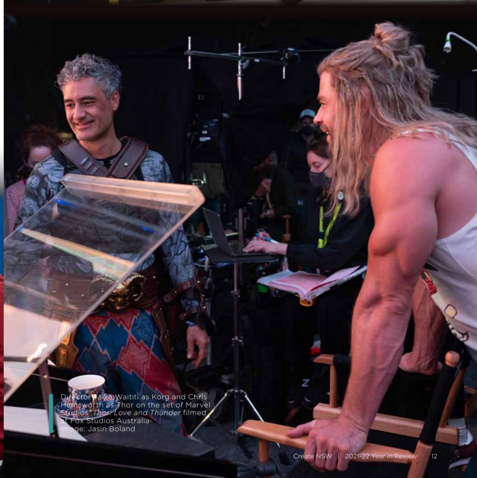
Director Taika Waititi as Korg and Chris Hemsworth as Thor on the set of Marvel Studios' Thor: Love and Thunder filmed at Fox Studios Australia