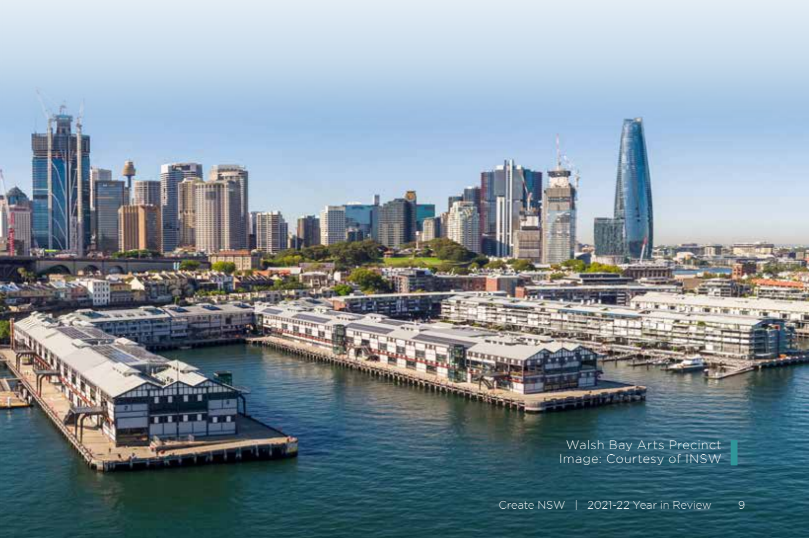
Walsh Bay Arts Precinct

The Precinct presents a vibrant year-round program of musical concerts, dance and theatre performances and workshops, classes, and public events. It is a unique artistic and cultural neighbourhood where world class artistic presentations are conceived, planned, rehearsed, created, performed, and shared.