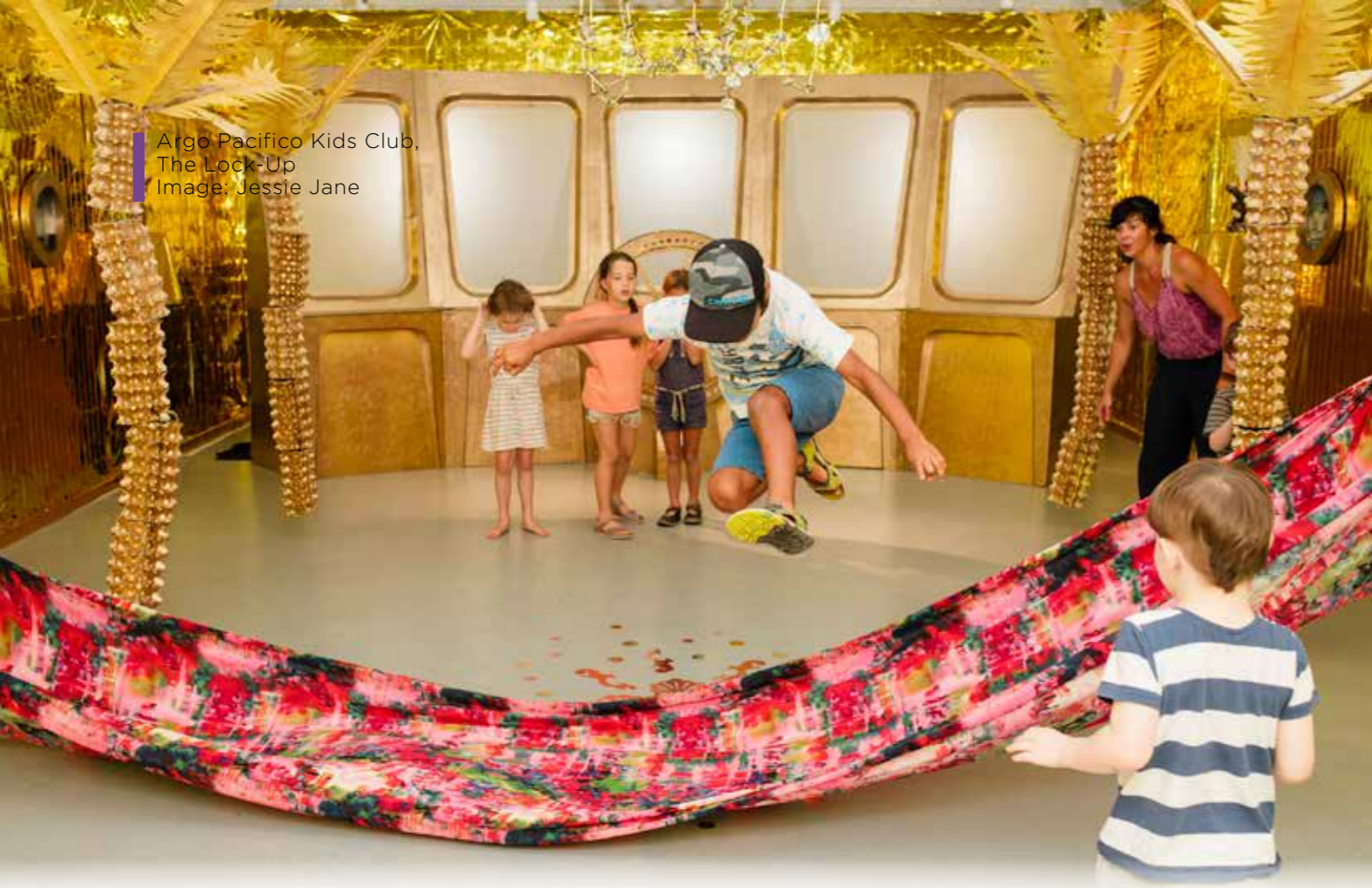
Argo Pacifico Kids Club, The Lock-Up