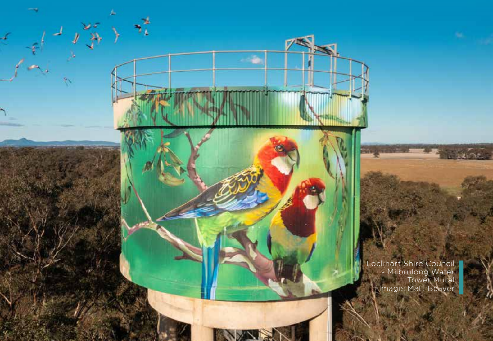
Lockhart Shire Council - Milbrulong Water Tower Mural