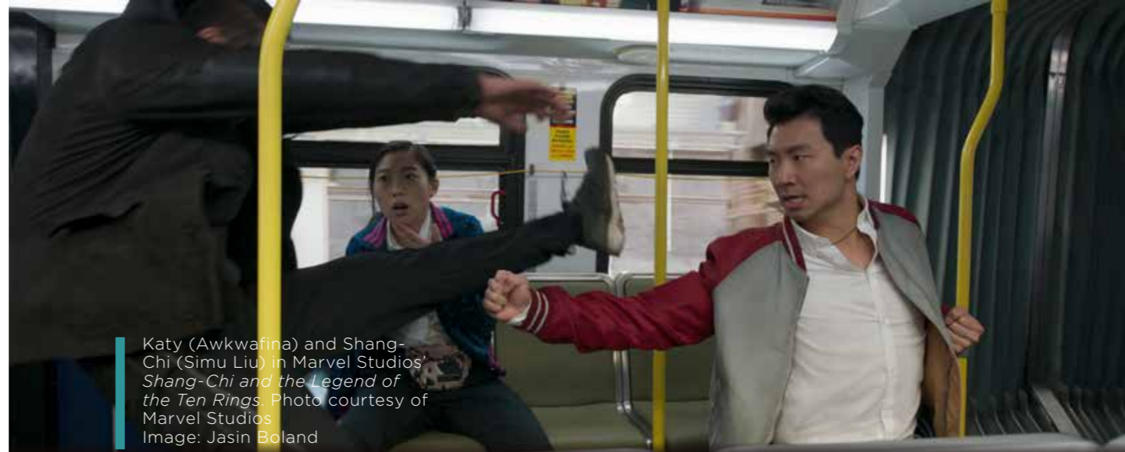
Katy (Awkwafina) and Shang-Chi (Simu Liu) in Marvel Studios' Shang-Chi and the Legend of the Ten Rings.