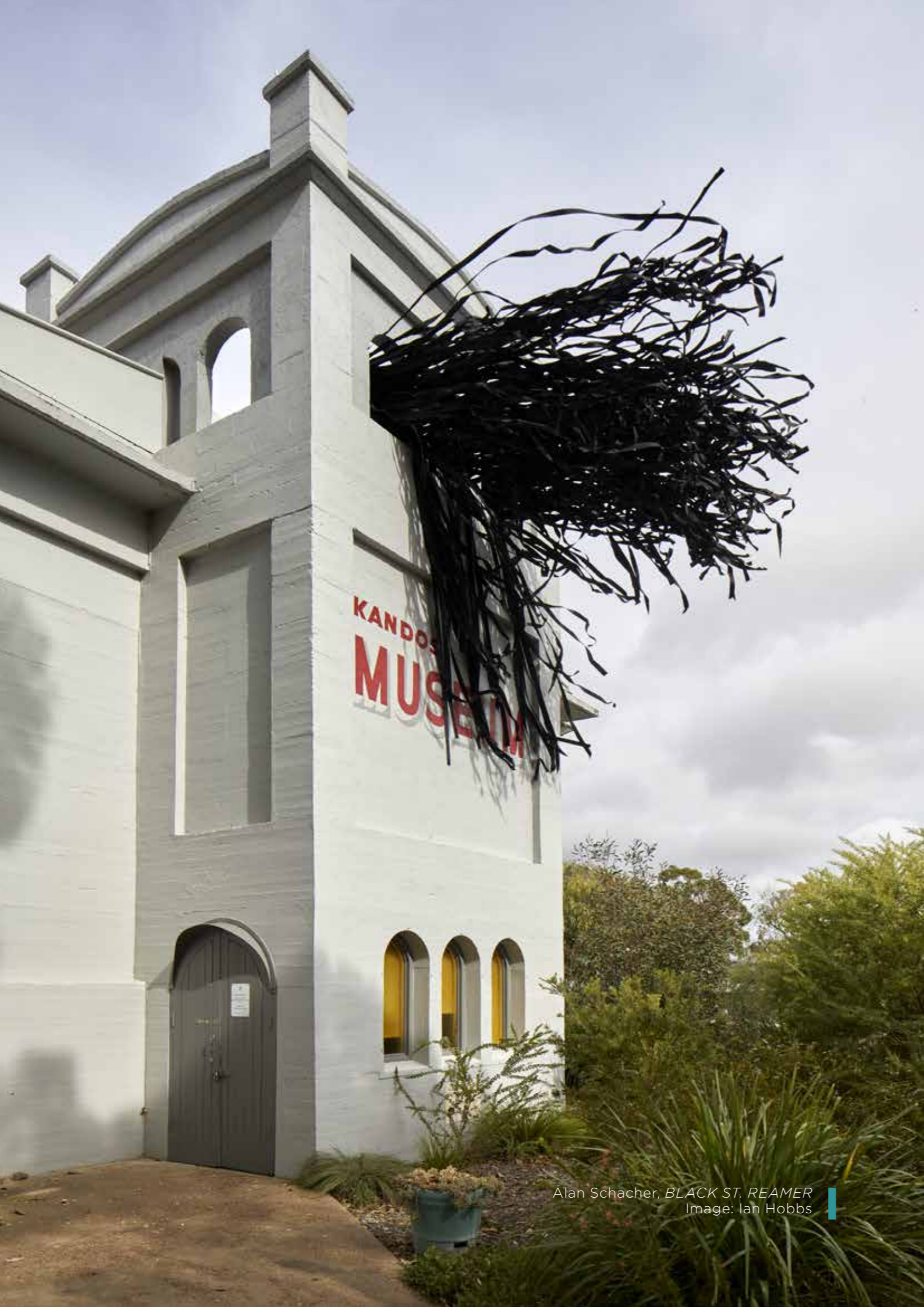
Alan Schacher, BLACK ST. REAMER