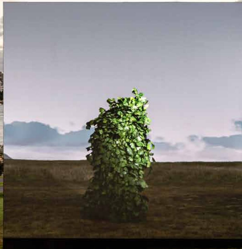
John Gerrard, Leaf Work . Courtesy of the artist Image: Document Photography

This funding leveraged over $334 million in total project and program value, including approximately $222 million paid in wages to artists and arts workers.