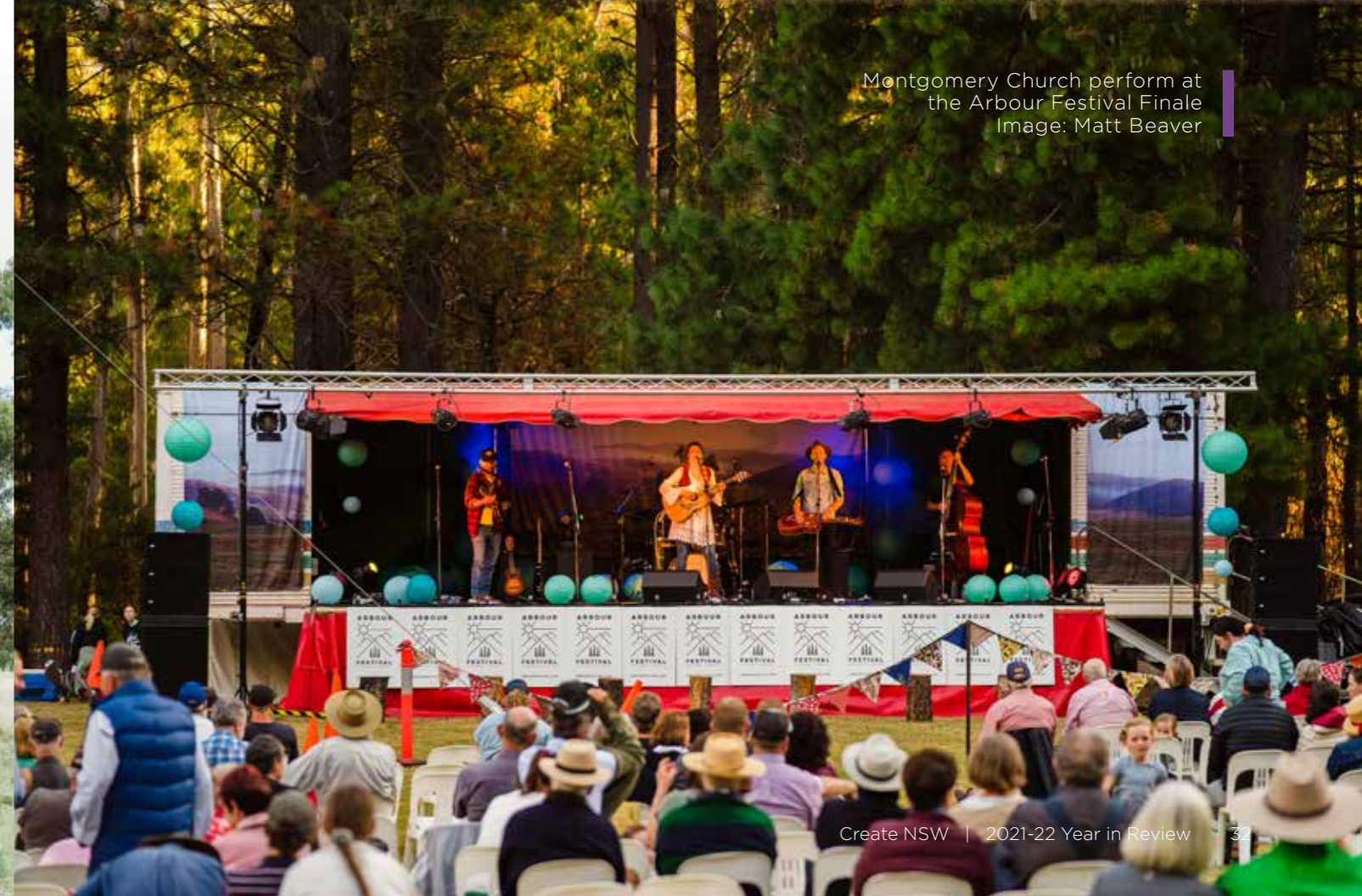
Montgomery Church perform at the Arbour Festival Finale