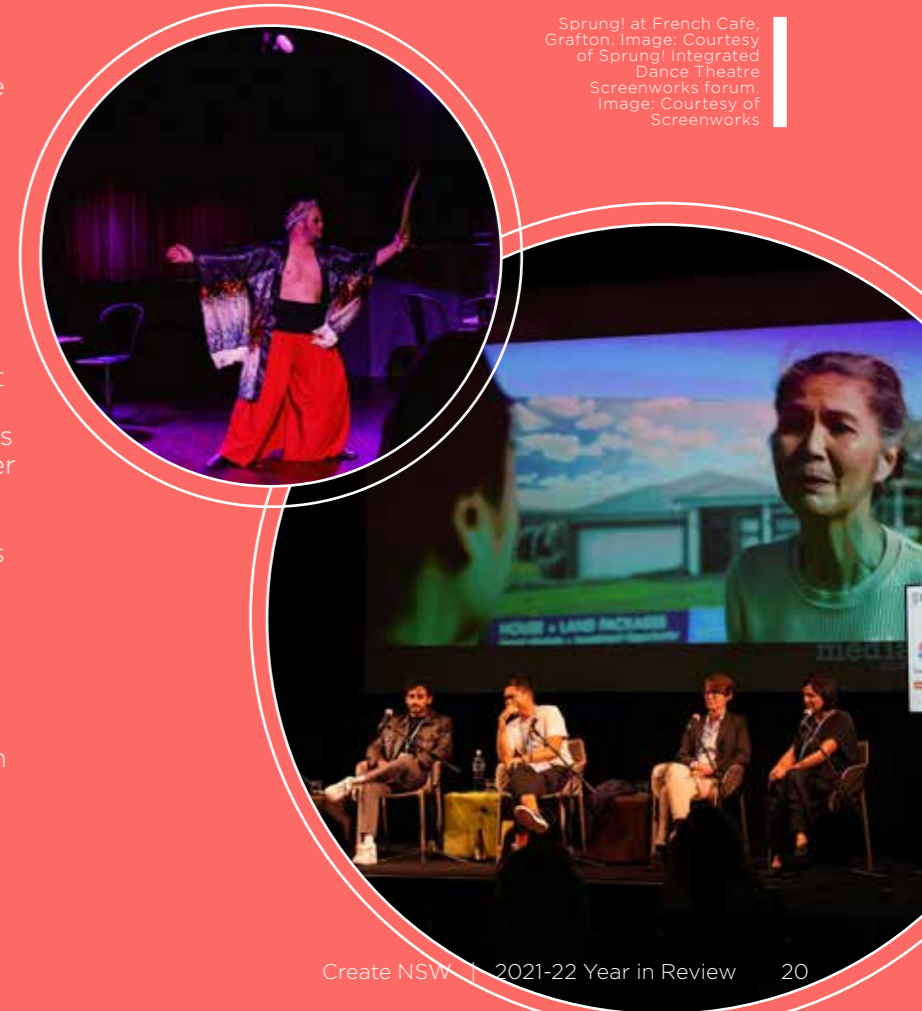
Sprung! at French Cafe, Grafton. Screenworks forum.

Based in the Northern Rivers, Screenworks is one of the key stakeholders delivering on the NSW Government's regional priority area across the Screen sector. With support from Screen NSW, Screenworks delivers professional industry programs and activities for people at every career stage to develop their skills and build a diverse and thriving regional screen sector in NSW. Screenworks facilitates important networking opportunities, fostering industry connections for regional screen content creators. It also supports local and non-local film productions in the Northern Rivers region to secure locations and production crew. In early 2022, Screen NSW devolved funds to Screenworks to run a micro grants program to support flood affected screen practitioners in the Northern Rivers.