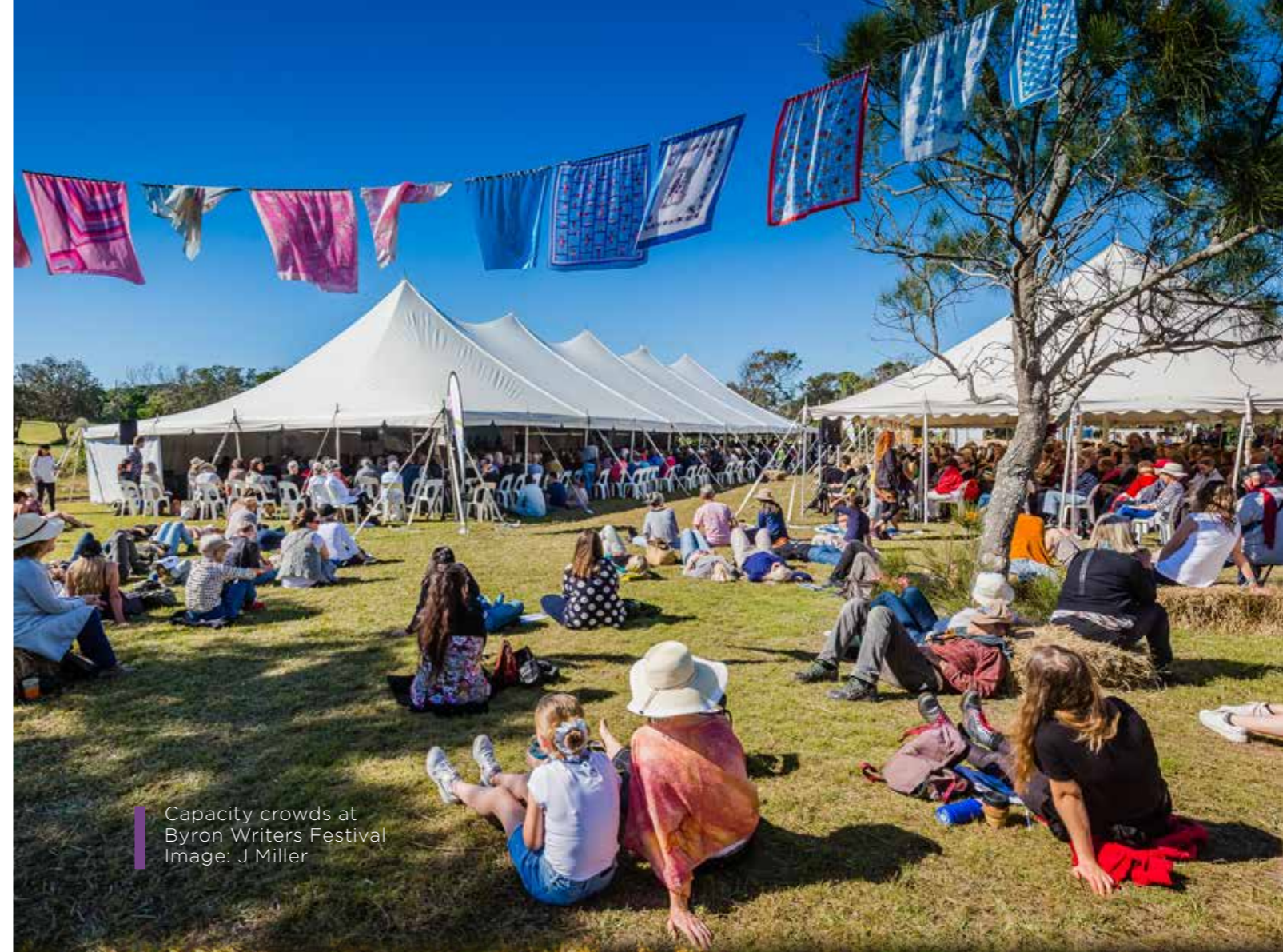
Capacity crowds at Byron Writers Festival

The Screen Audience Development program supports a range of public screenings, festivals and tours that provide opportunities for audiences to see and experience quality screen content across NSW. In 2021/22 Screen NSW provided support to 16 festivals to deliver to over 130,000 audience members in 56 locations across Sydney, Western Sydney and regional NSW.