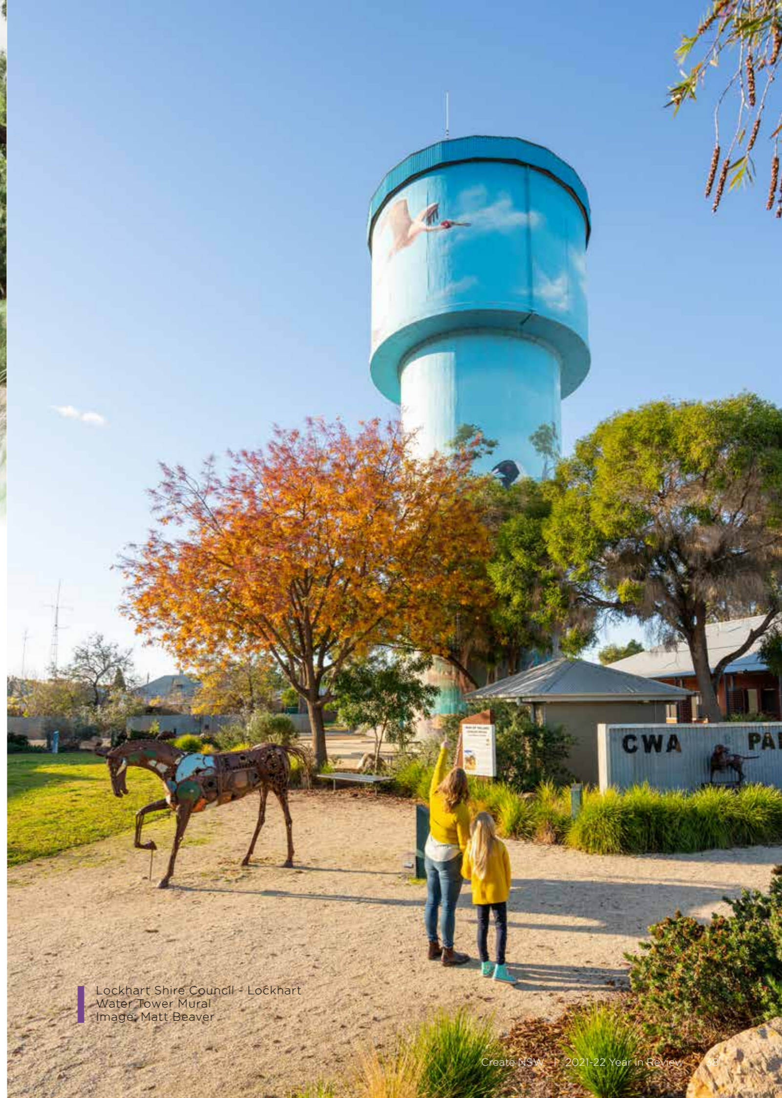
Lockhart Shire Council - Lockhart Water Tower Mural

The Regional Arts Network has been developed over the past 30 years with core funding from the NSW Government and through local Council support, to assist RADOs to inform and promote arts and cultural activity within the local community including opportunities for creative professionals in the regions.