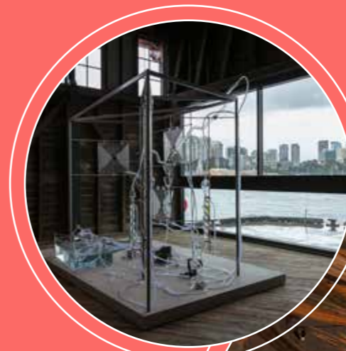
Melissa Dubbin and Aaron S. Davidson, THE CLOUD IN THE OCEAN . Courtesy the artists. Commissioned by the Biennale of Sydney. Image: Document Photography Installation view, 23rd Biennale of Sydney. Image: Document Photography.

Since 2001, the tenants at One Canal Road have supported 194 feature films with worldwide box office revenue over $19.1 billion. Accommodating multiple productions over the years including many TV dramas, theatre shows, and TV commercials. This precinct supports approximately 350 screen and arts jobs and has 150 to 200 people working onsite daily.